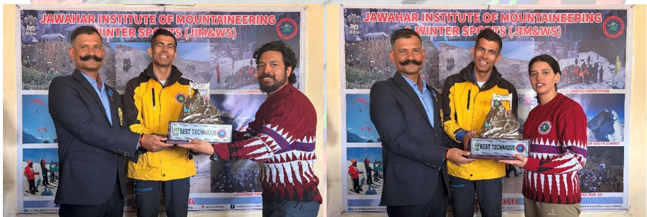
BEST IN TECHNIQUE