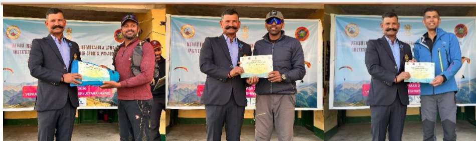
TOP 03 POSITIONS IN MAXIMUM AIR TIME COMPETITION