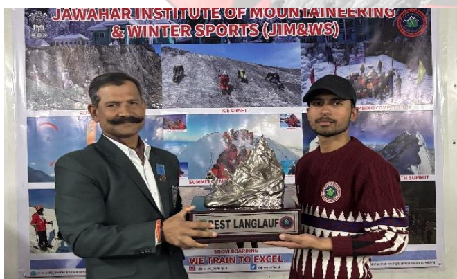
BEST IN LANGLAUF