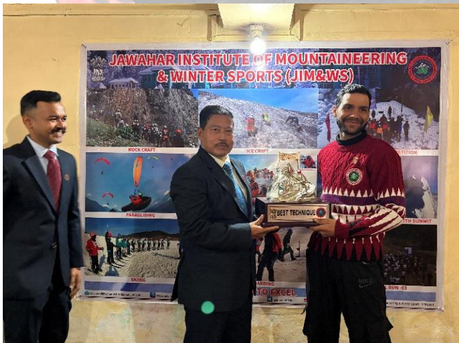
BEST IN TECHNIQUE