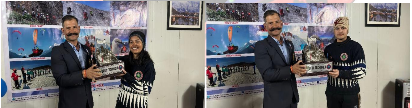
BEST IN TECHNIQUE