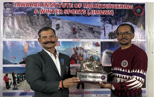
BEST IN TECHNIQUE