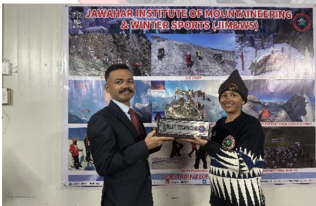
BEST IN TECHNIQUE