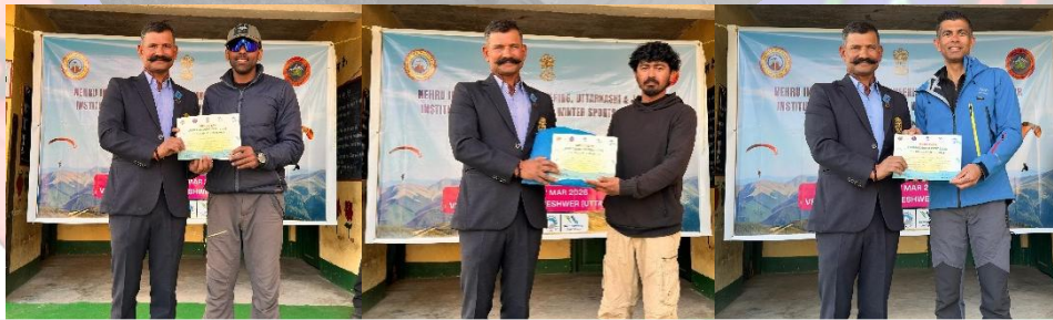
TOP 03 POSITIONS IN ACCURACY COMPETITION