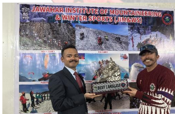
BEST IN LANGLAUF