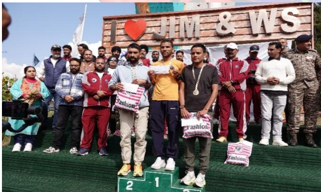
TOP 03 POSITIONS IN MALE CATEGORY

2. To recognize the spirit of participation and sportsmanship, 20 consolation prizes and 100 special prizes were awarded during the prize distribution ceremony held at Pahalgam. The event was graced by Colonel Hem Chandra Singh, Principal, JIM & WS, along with officials from the civil administration and the tourism department. The Lidderwat Trail Run continues to stand as a flagship initiative of JIM & WS, promoting adventure, resilience, and national integration through outdoor activities while showcasing the region's breath-taking natural beauty.