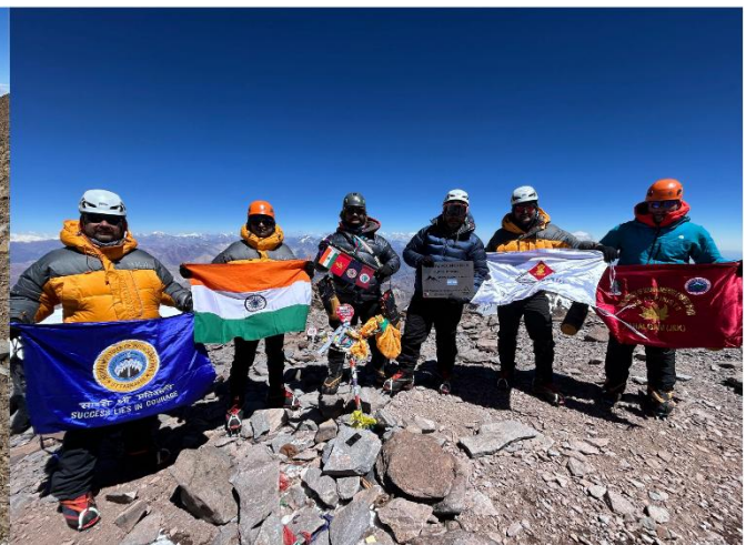
SUMMIT OF MT ACONCAGUA (6961 M) ON 22 FEB 2026