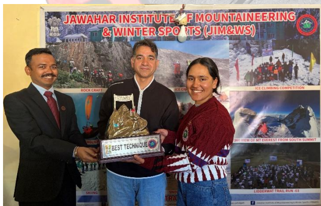
BEST IN TECHNIQUE