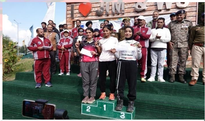
TOP 03 POSITIONS IN FEMALE CATEGORY