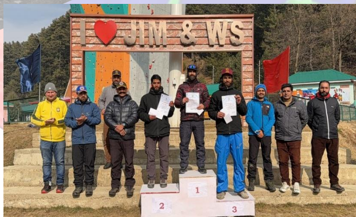
TOP 03 POSITION HOLDERS