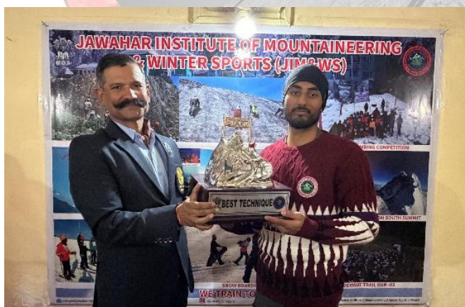
BEST IN TECHNIQUE