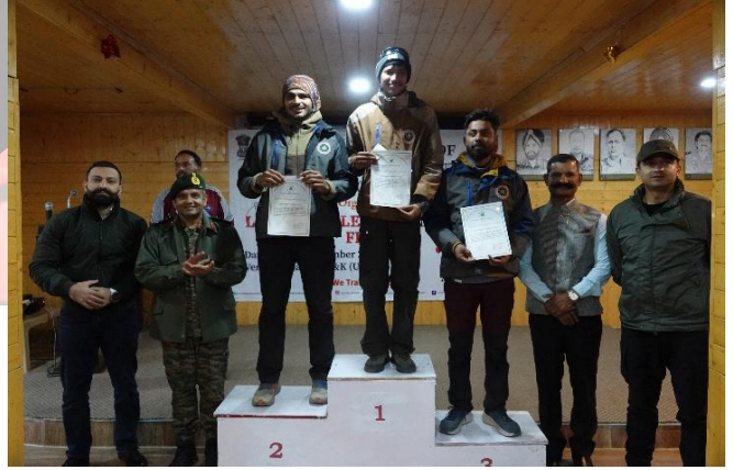
TOP 03 POSITIONS IN MAXIMUM AIR TIME COMPETITION