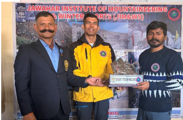
BEST IN TECHNIQUE