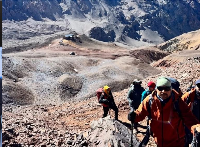
TOWARDS BASE CAMP