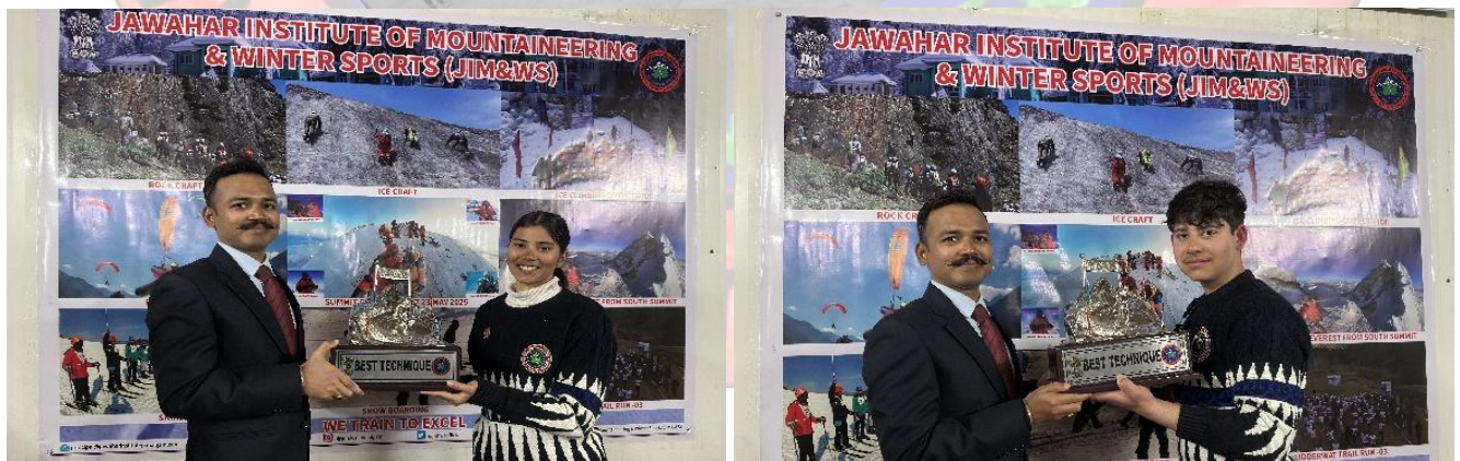
BEST IN TECHNIQUE