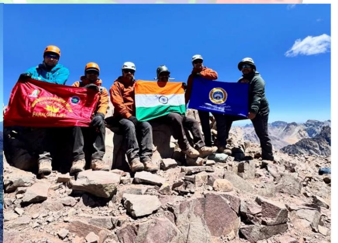
SUMMIT OF MT BONETE (5052 M)