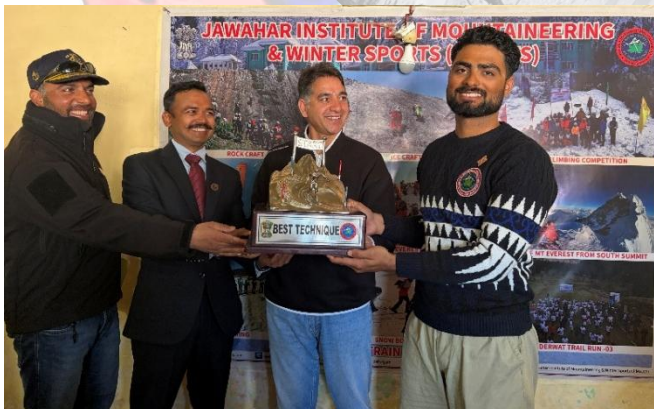
BEST IN TECHNIQUE