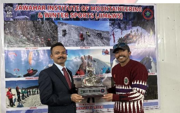
BEST IN TECHNIQUE