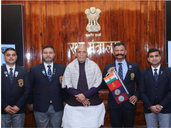
FLAG OFF BY RM SHRI RAJNATH SINGH