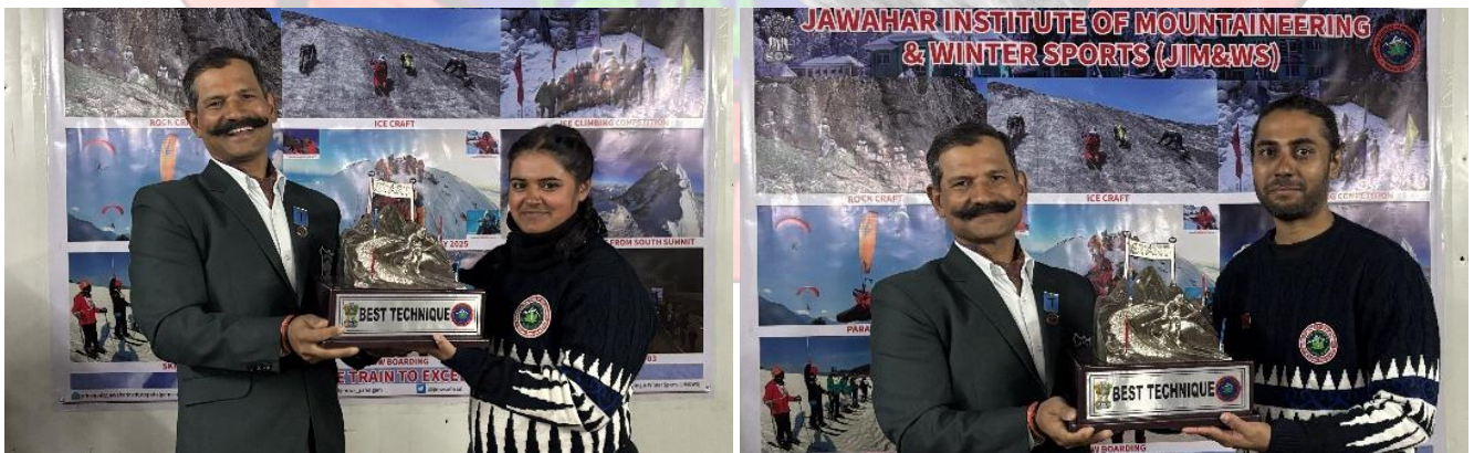
BEST IN TECHNIQUE