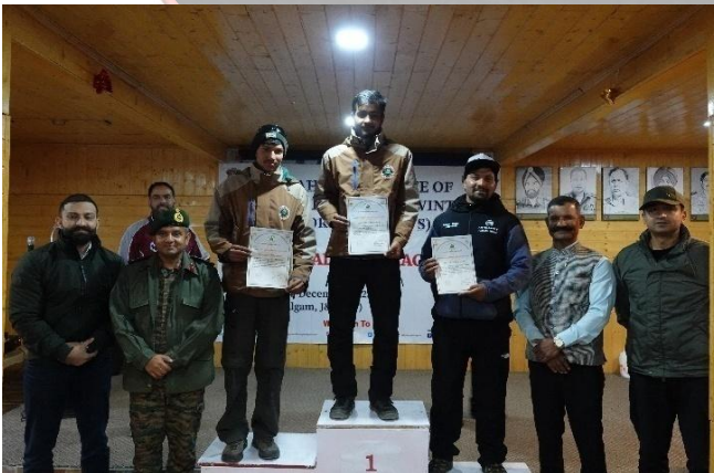
TOP 03 POSITIONS IN ACCURACY COMPETITION